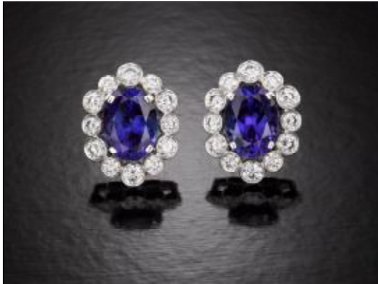
Van Cleef & Arpels tanzanite earrings

The 16.86 ct cushion-cut tanzanite has a pear-shaped brilliant-cut diamond set on each side (0.87 ct total). An additional 16 round brilliant-cut diamonds are bezel-set around the ring. The diamonds have a total weight of approximately 2.34 cts, with D–E color and VVS clarity. Part of a matched necklace and earring suite. Total diamond weight of the suite is 33.04 cts. Price upon request.