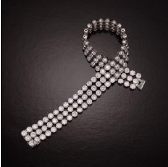
Harry Winston diamond and platinum bracelet

Contains three rows of matched round brilliant diamonds, 144 in all, with a total weight of 22.74 cts. D–F color and VVS1 clarity. Part of a matched necklace and earring suite. Total diamond weight of the suite is 78.65 cts. Price upon request.