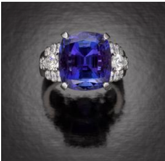
Van Cleef & Arpels tanzanite ring